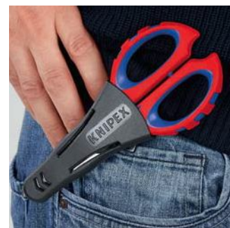
Safely stored and ready to hand at all times