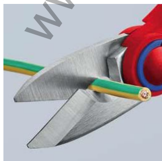
Integrated cable cutter